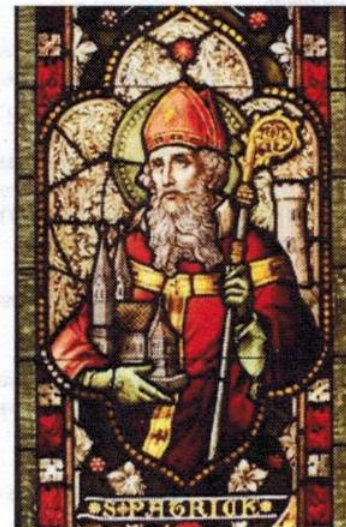
St. Patrick depicted in a stained glass window